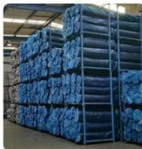
fabric roll storage