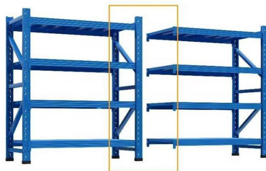
Main frame and sub frame share one column

The main frame has two columns frames, which can be used independently, Add on rack cannot be used alone, which must be used with the main rack.